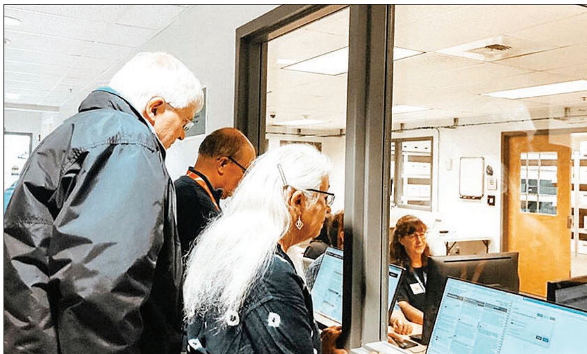
The Pierce County Auditor's office is large enough to feature a glass-fronted walkway where observers can watch election officials at work.