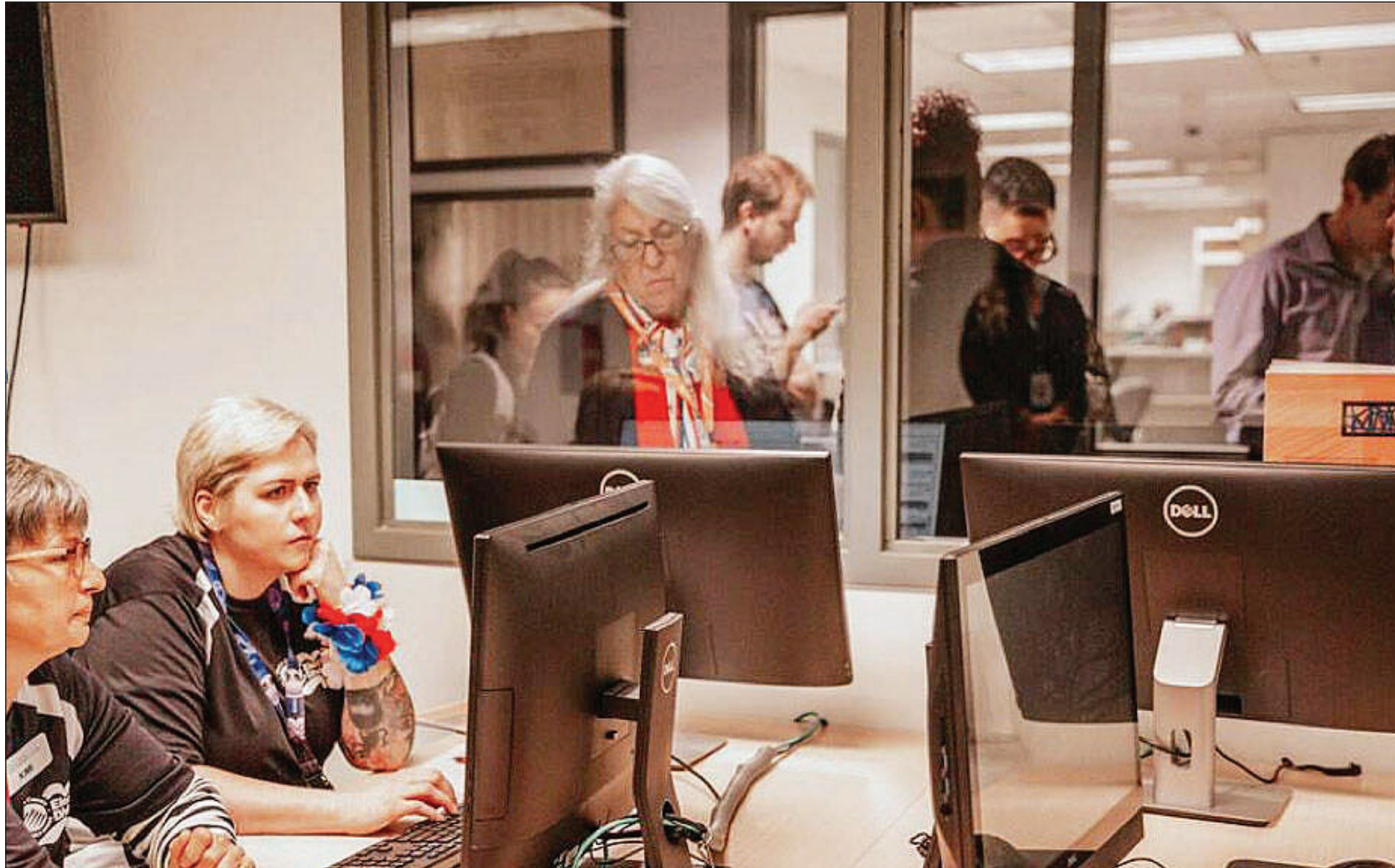
Observers in Pierce County watch election officials at work from a glass-fronted walkway.